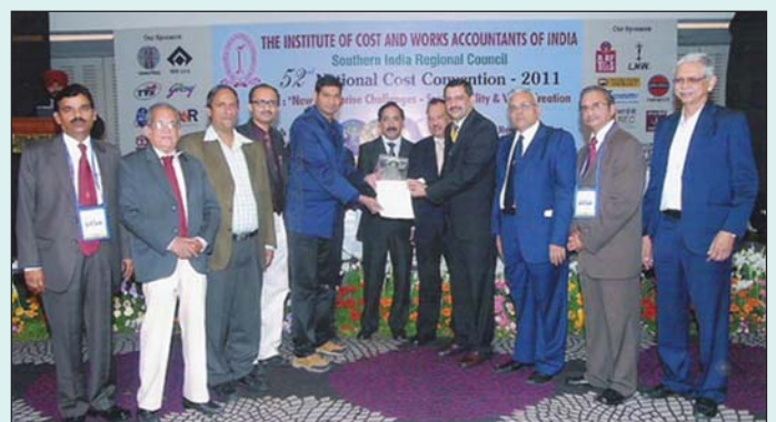
Category "D" JABALPUR