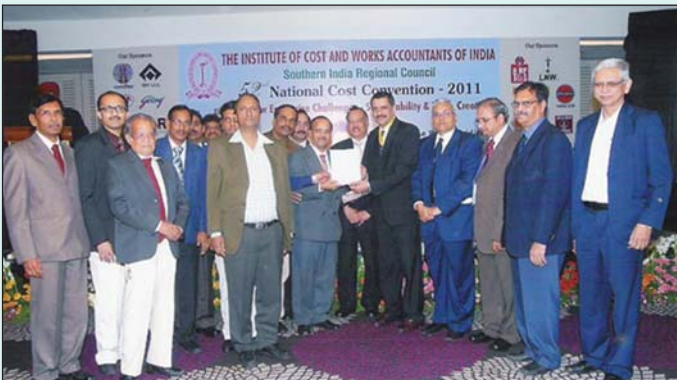
Category "A" AHMEDABAD

In the 52nd National Convention held at Chennai, following Chapters under WIRC were given "Best Chapter Award" for the year 2010.