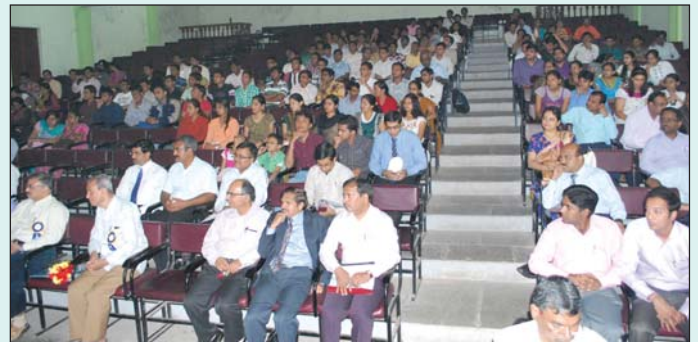
Audience at large during Annual function organised by Surat SG Chapter on 23/1/2011