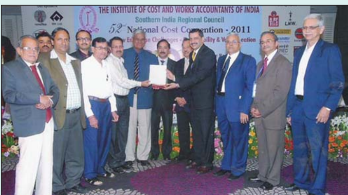
Category "C" AURANGABAD