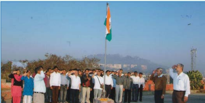
Flag hoisting on the occasion of Republic Day at PCCA's Premises.