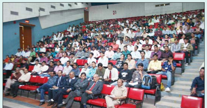
View of students during 3rd Western India Regional Students Conference organized by Baroda Chapter on 24th January 2011.