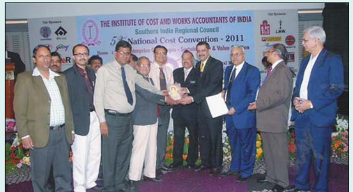
Category "B" SURAT-SOUTH GUJARAT