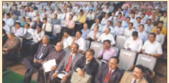
CFO's, Top Officials, eminent resource persons from Renowned industry, Service sector and Government departments attended Regional Cost Conference -2010