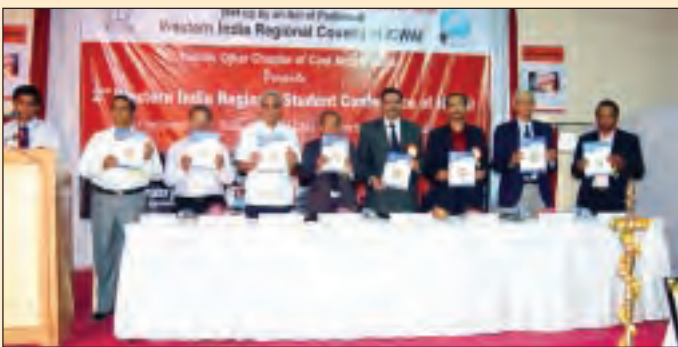
Release of Souvenir