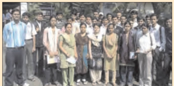
Group Photo of Students Participated in Industrial Visit organised by Pune Chapter on 28-2-2010.