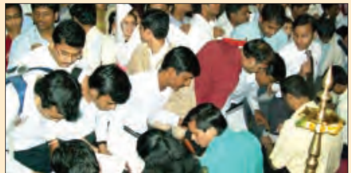
View of Students for Campus Interview organized by Nashik Chapter on 14th February 2010.