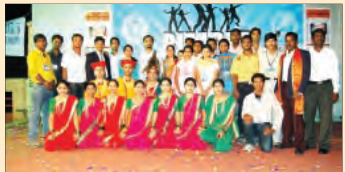
Group photo of students participated in Cultural Programme.