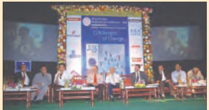
Guests on dais – inaugural function of Second Day