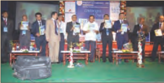
Release of Souvenir