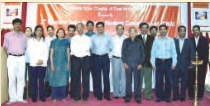
Representative of Companies participated in Campus Interview organized by Nashik Chapter on 14th February 2010.