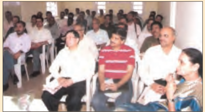
View of members during Programme on Union Budget organized by WIRC on 27-2-2010.