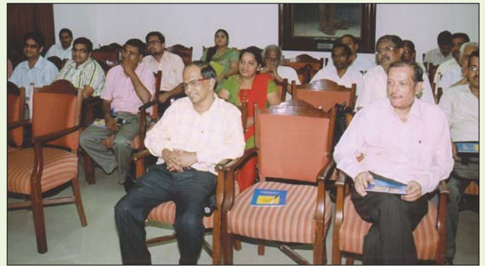
View of Faculty Members during Faculty Meeting organized by WIRC on 3rd September 2010 at Mumbai.