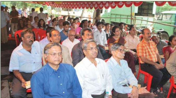
View of Students and Members during inauguration of Students and Members Facilitation Centre at Thane on 4th September 2010.