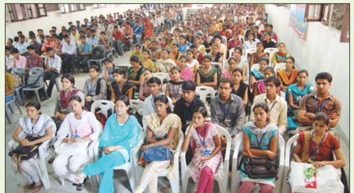
View of students of St. College, Jabalpur during Career Guidance lecture.