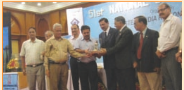
Category C - Kalyan-Ambernath