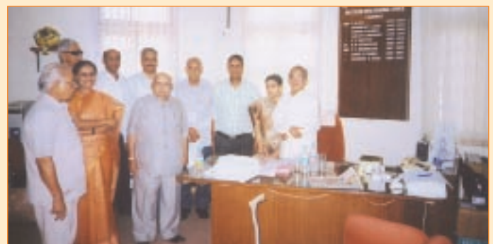
Past Presidents and Past Chairmen and other Council Members with WIRC Chairman during Shree Satya Narayan Maha Pooja