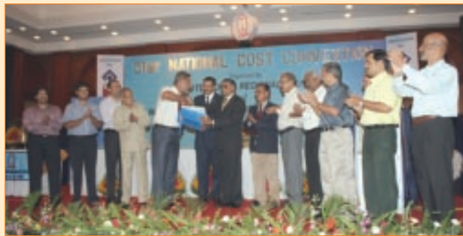
Category A - Pune