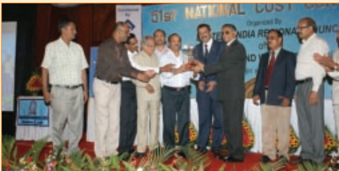
Category B - Ahmedabad